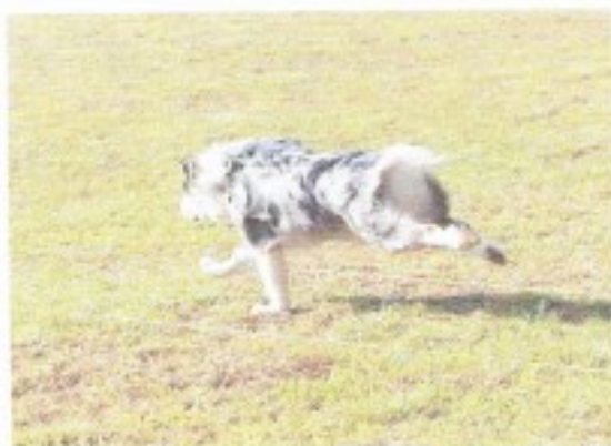
Figure 2. In this galloping dog, the dewclaw is in touch with the ground. If the dog then needs to turn to the right, the dewclaw digs into the ground to support the lower leg and prevent torque.

--from Miller's Guide to the Dissection of the Dog